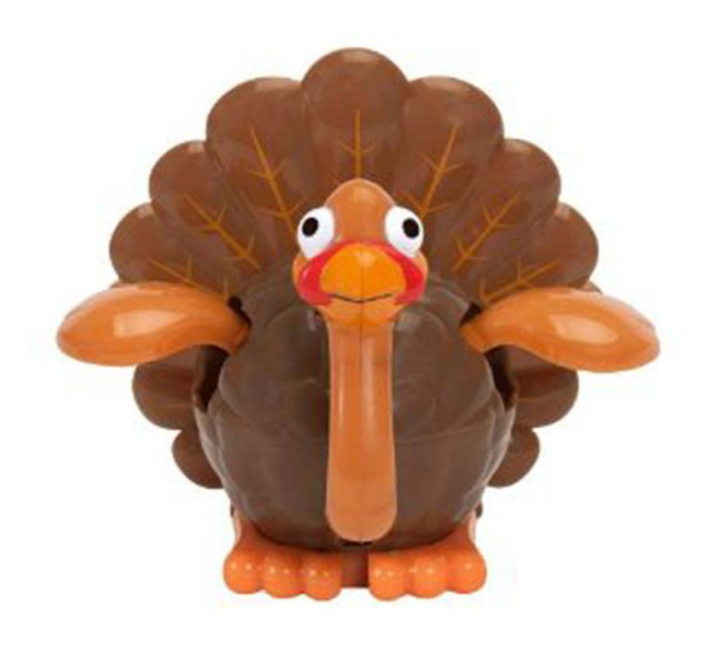
If you have the best review of this solar turkey — or maybe even the second-best review — this guy could be yours.

looking for much shorter entries; 75 words would be lengthy for us. Search on Amazon.com with the exact words below, or click on the links, to find the product to "review."